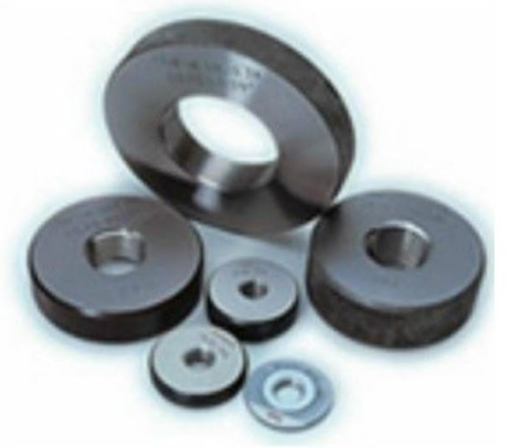
Tamponi ed anelli di riscontro per la verifica delle filettature. Pads and stop rings for checking the threads.